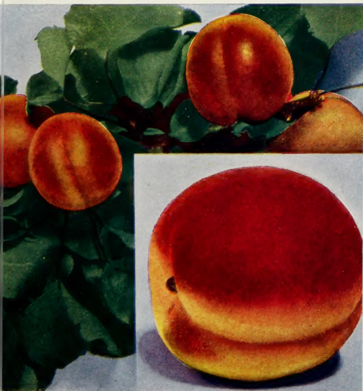
RILAND (U. S. Plant Pat. No. 74) APRICOT

* Tilton —Larger than Blenheim, oval—fine flavor. Considered one of the best commercial canners.